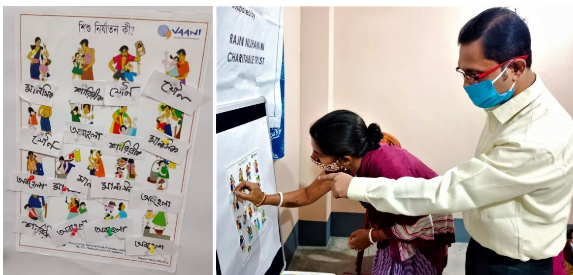
Above right & Below: Parents participate to identify the types of Abuses

Parents were demonstrated the signs of the private parts of the body and were also made aware of how they can help ensure Safety of their children by knowing the 'No Go Tell' Rule