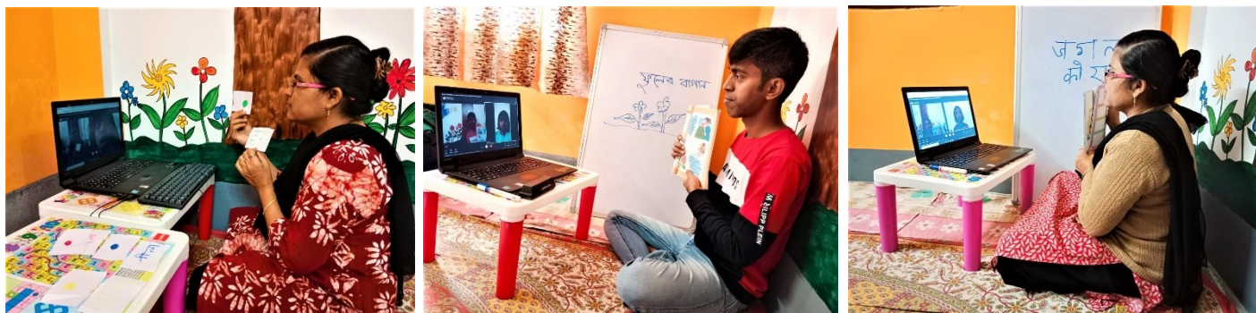
Conducting Virtual Sessions from the Centre

Teachers had no choice but to continue the use of the Virtual mode of teaching as the COVID protocol for young children were not relaxed till December 2021. Parents had no choice but to learn and adapt to the New Normal. They were very involved in ensuring that learning continued for their children. As support for parents to work with their children at home, worksheets and videos were shared by the teachers.