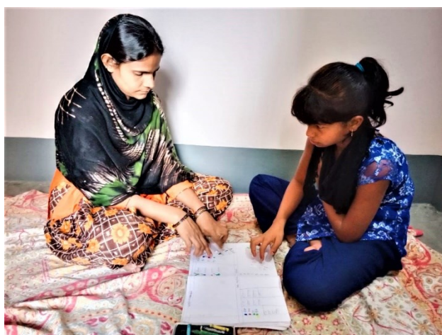
Below: Parents follow up at home

Teachers had no choice but to continue the use of the Virtual mode of teaching as the COVID protocol for young children were not relaxed till December 2021. Parents had no choice but to learn and adapt to the New Normal. They were very involved in ensuring that learning continued for their children. As support for parents to work with their children at home, worksheets and videos were shared by the teachers.