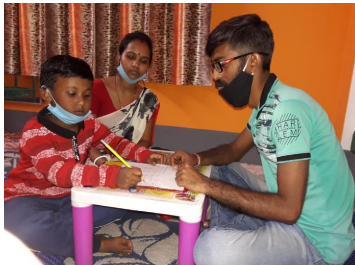
Sessions at the Centre in April'21