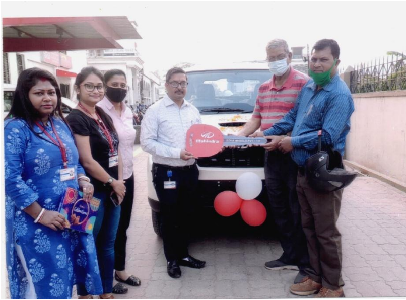
Vehicle being received by our Team