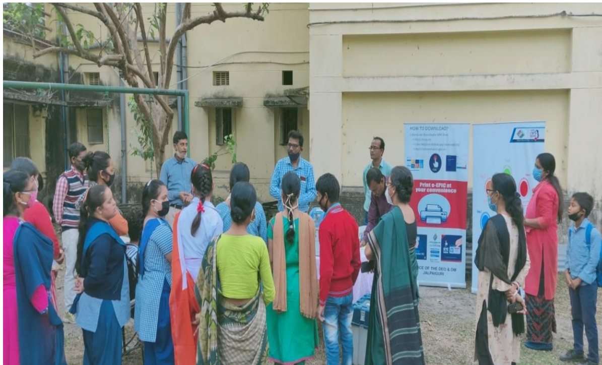
District Social Welfare Officer, Jalpaiguri explaining the students about assembly elections

❖ An awareness camp on voting for upcoming assembly elections for adult youth with disabilities was organised by officials of Jalpaiguri district at Prerana on 9 th March 2021. This year our 4 students who were eligible to cast vote had obtained voter card with support from the district officials. A similar program was organised at Prerana by the officials of the election cell S.D.O. office Darjeeling district. This year Seven (07) adult youth with disability from Prerana were able to cast their vote.