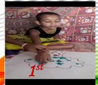
Nandini Mondal PWID MODERATE 0-6 YRS